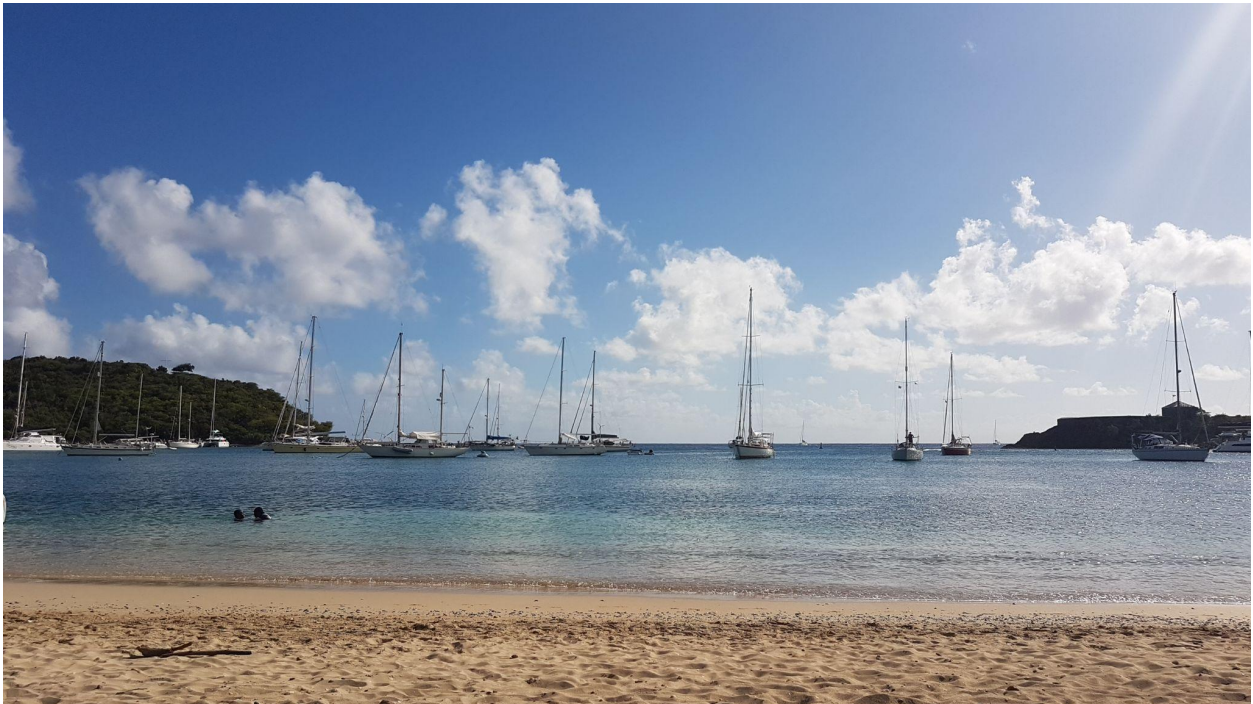
Galleon Beach, English Harbour, Antigua & Barbuda

Have you heard about Nomad Digital Residence(NDR)? Antigua and Barbuda is offering a long-stay visa programme and it is designed for people whose work can be done remotely and are passionate about doing so from a safe Caribbean country with access to modern amenities, including a sound telecommunications infrastructure. Eligible persons will be granted a special-resident authorisation that will be valid for up to two ( 2) years.